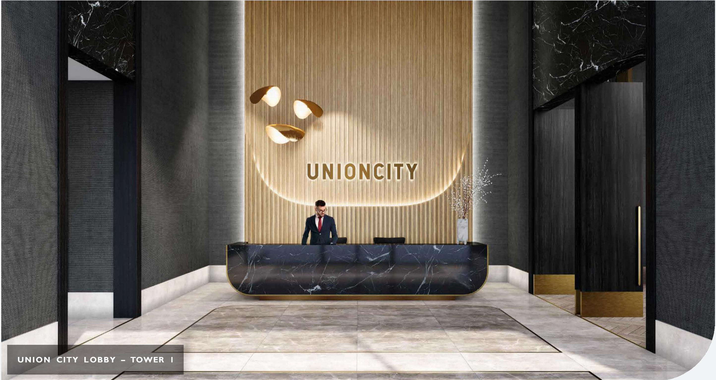
UNION CITY LOBBY - TOWER I