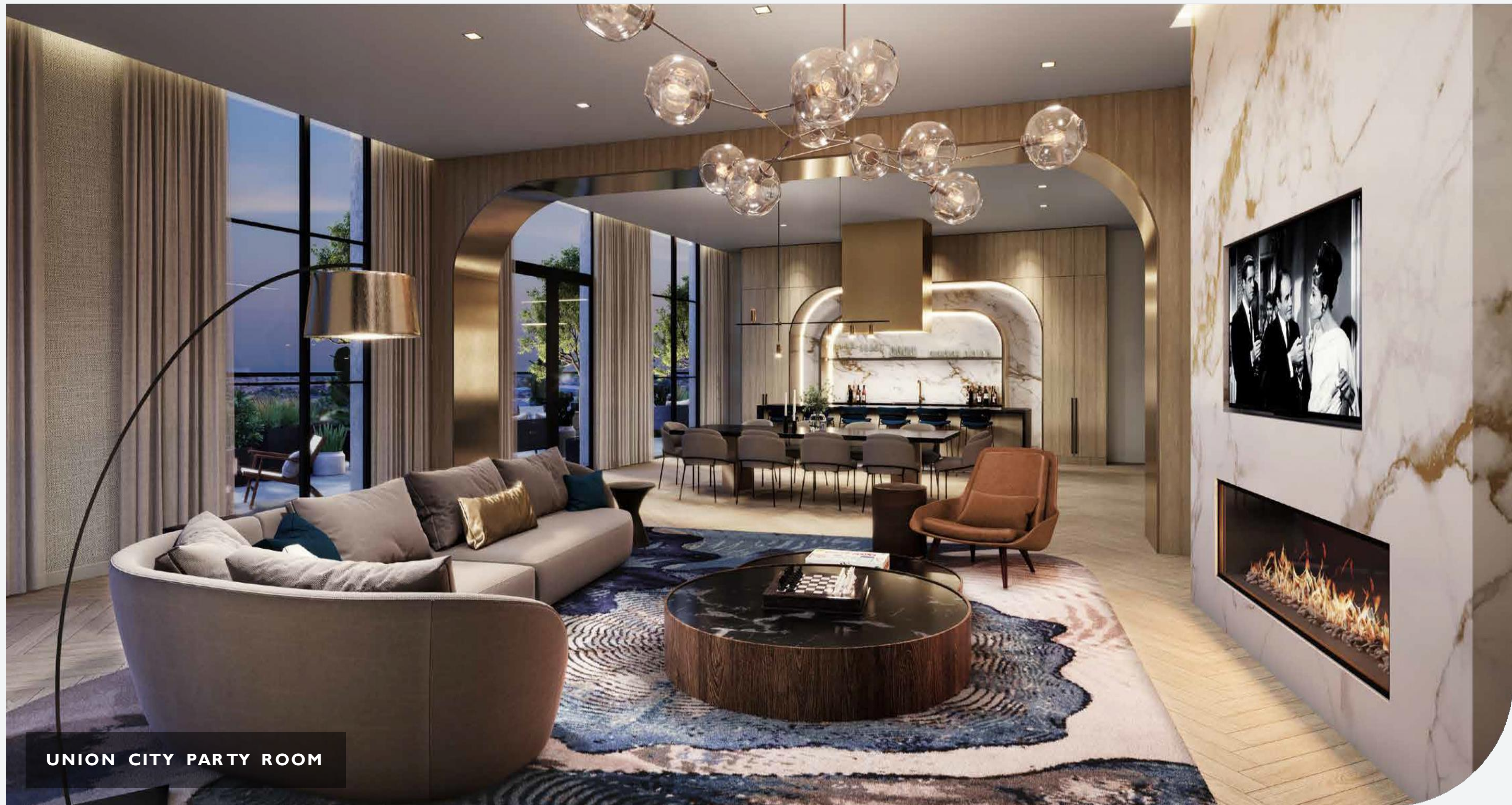
UNION CITY PARTY ROOM